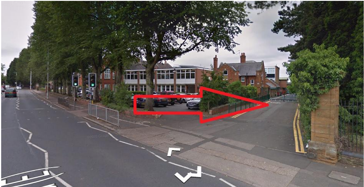
Entrance road to the pool:

All Parents/Guardians and any visitors you may bring must read our General Terms and Conditions and the full NSB Rules and Regulations before arriving. This is especially important if you send a guardian/relative in your place. Your attendance at our lessons is acknowledgement and acceptance of our Rules, Terms and Conditions without exception. You are responsible for the safe supervision of any children you bring at all times. Children should always be under the direct supervision of an adult and never be left unattended.